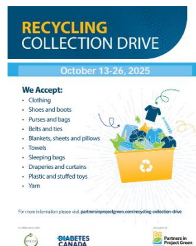
FIGURE 6 ACCEPTED TEXTILE ITEMS POSTER