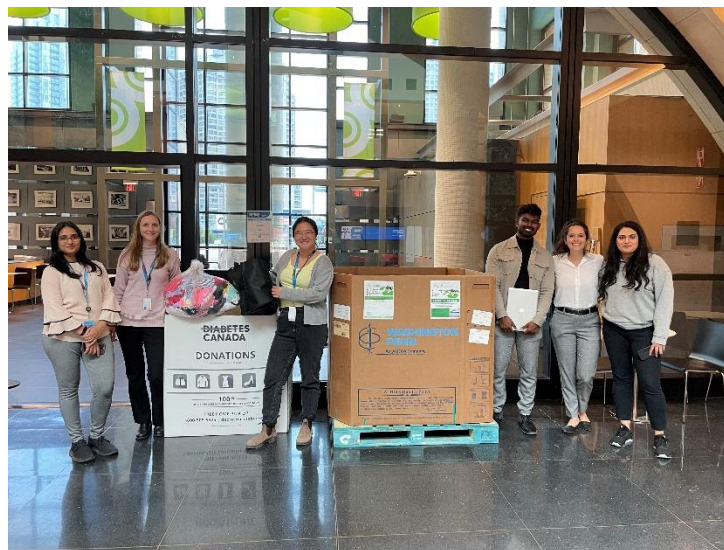
FIGURE 1 CITY OF MISSISSAUGA PARTICIPATING IN THE RCD 2023

Recycling Collection Drive is a great way to engage your employees during Waste Reduction Week and Circular Economy Month in Canada. The 2025 program will run for two weeks, October 13-26, one week overlapping with Waste Reduction Week. Recycling Collection Drive participants place temporary bins in their front lobby for the campaign to collect clothing, household textiles, electronic waste, and books that employees and the community donate. At the end of the campaign, the materials will be reused and recycled by Diabetes Canada , Electronic Recycling Association (ERA) , and Second Life Books . Each participating organization will receive a certificate with the amount of material diverted from landfill as a result of the campaign.