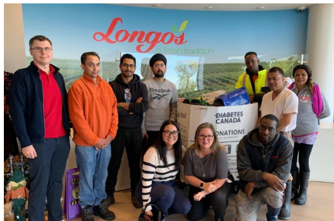
FIGURE 3 LONGO'S PARTICIPATES IN RCD 2022

A: To allow us to easily transport the material, all clothing must be placed in clear or translucent plastic bags before being placed into the bin. However, electronics can be placed directly into the appropriate bin.