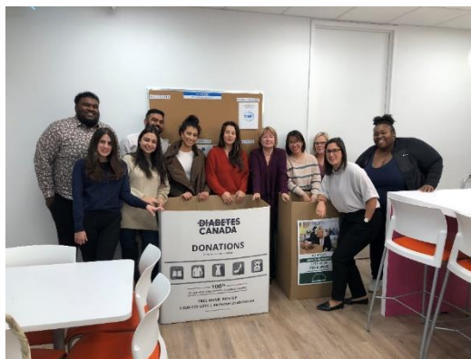
FIGURE 8 SODA STREAM PARTICIPATING IN THE RCD 2019