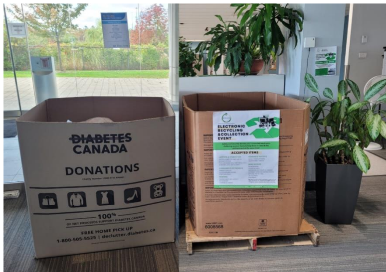
FIGURE 2 TEXTILE AND E-WASTE COLLECTION BINS

Book Pallet Mounted Collection Bin is 47"W x 39"D x 36"H.