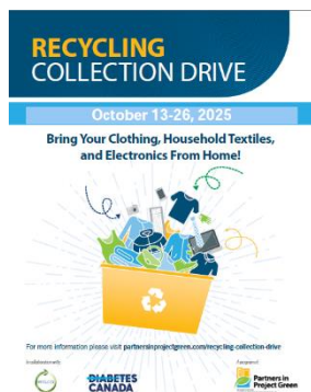
FIGURE 4 EVENT POSTER