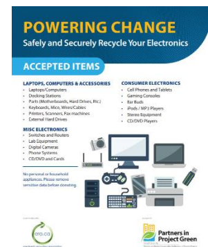
FIGURE 5 ACCEPTED E-WASTE ITEMS POSTER