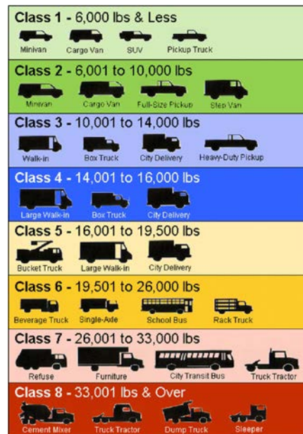
Figure 1. Vehicle weight classes as defined by the Federal Highway Administration, US Department of Transportation (USDOT).

Medium-duty vehicles (MDVs) are categorized under Classes 2b to 6, based on their Gross Vehicle Weight Rating (GVWR) by Transport Canada. This covers a range of delivery vans, pick-up trucks, refrigerated vans, Freightliners and mid-sized cargo trucks. Transport Canada offers additional information on vehicles classification: Eligible vehicles (canada.ca)