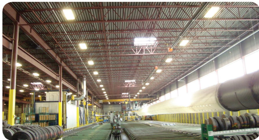
The 142,000 square foot lighting retrofit has reduced energy consumption by 244 Watts per fixture, resulting in an annual energy cost savings of nearly $43,000.

The project took only one month to complete and has resulted in considerable costs savings for the facility. Lighting quality improved significantly thanks to a 30 per cent increase in light lumens over the metal halide system. Savings per fixture amounted to 244 Watts, while the annual energy cost savings were nearly $43,000. The project, which totaled $87,363, has already paid for itself in a short 1.36 years and has resulted in a cooler workplace during summer months.